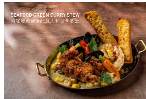
SEAFOOD GREEN CURRY STEW 青咖喱海鮮燴配意大利香草多士