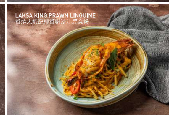
LAKSA KING PRAWN LINGUINE 香燒大蝦配椰香喇沙汁扁意粉