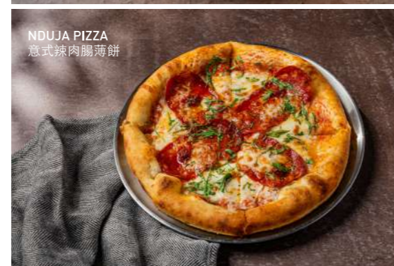
NDUJA PIZZA 意式辣肉腸薄餅