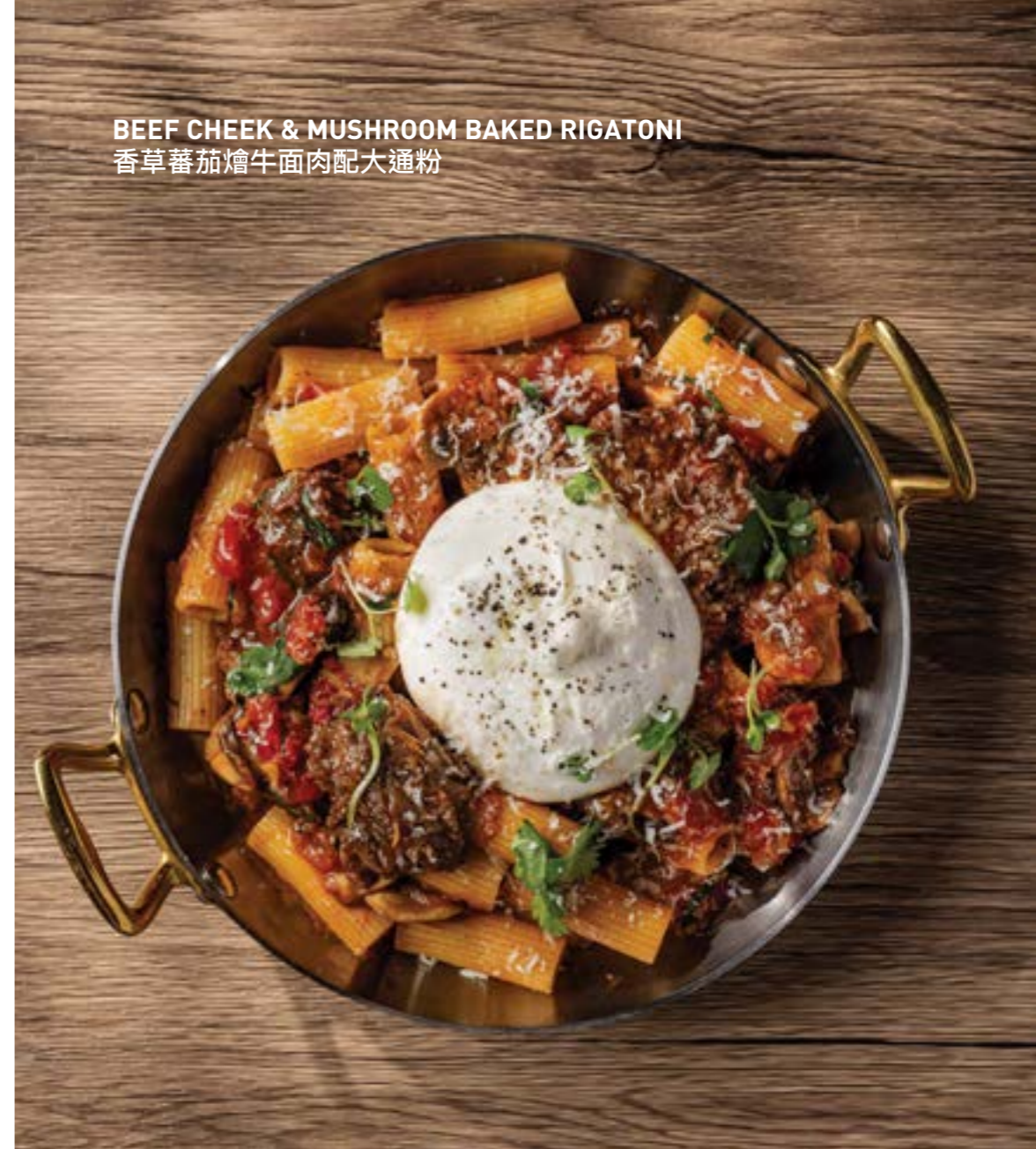
BEEF CHEEK & MUSHROOM BAKED RIGATONI 香草蕃茄燴牛面肉配大通粉