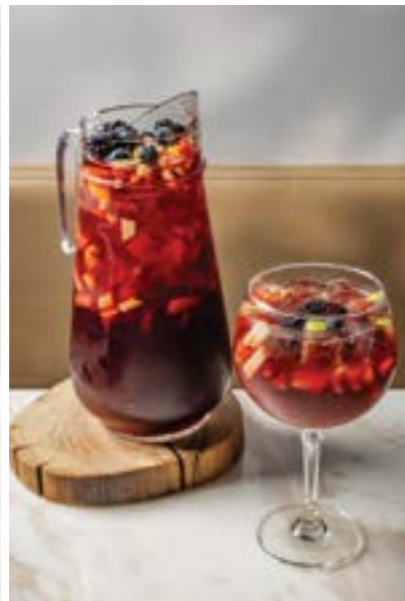
TROPICAL SANGRIA DELIGHT