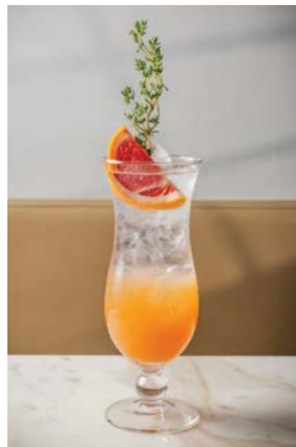
GRAPEFRUIT GINGER FUSION