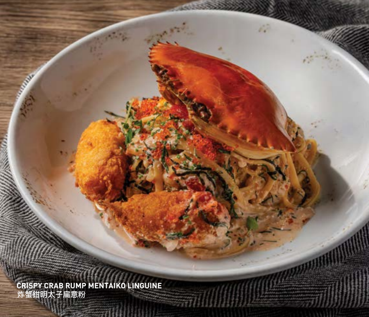
CRISPY CRAB RUMP MENTAICO LINGUINE 炸蟹鉗明太子扁意粉