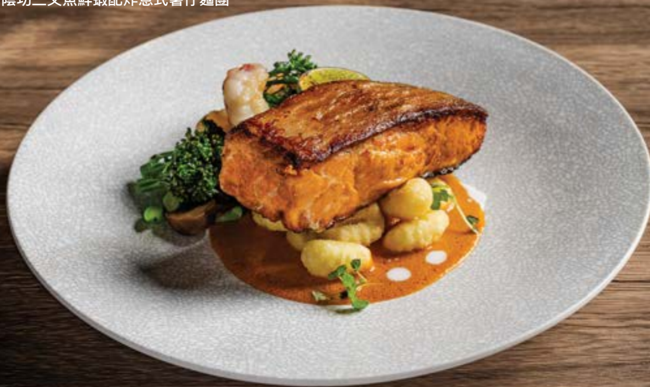
SEARED SALMON & SHRIMP TOM YUM 香煎冬陰功三文魚鮮蝦配炸意式薯仔麵團