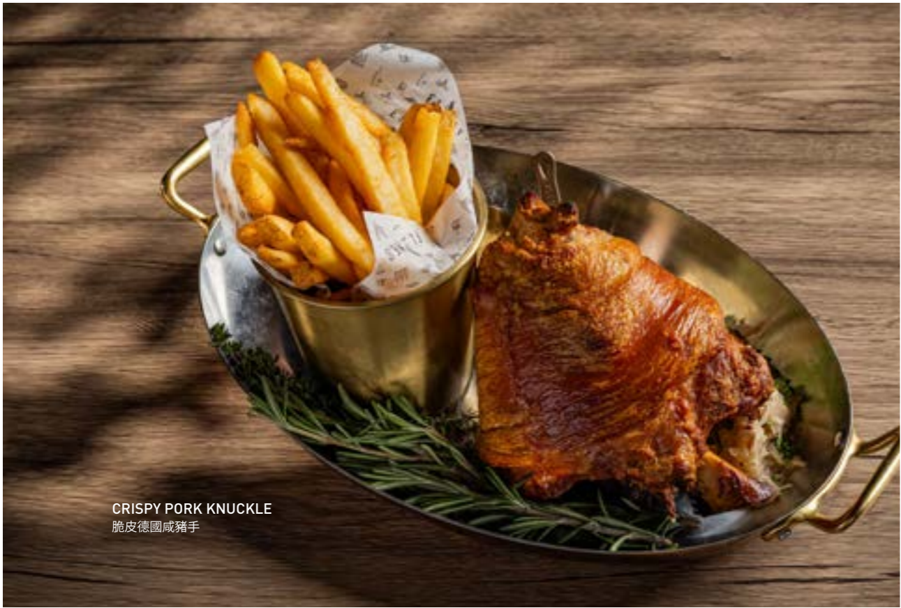
CRISPY PORK KNUCKLE 脆皮德國咸豬手