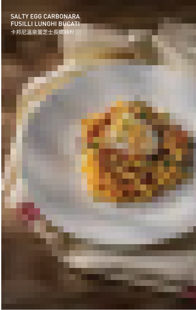
SALTY EGG CARBONARA FUSILLI LUNGI BUCATI 卡邦尼溫泉蛋芝士長螺絲粉