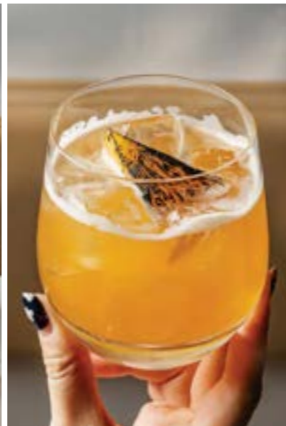
EARL GREY VODKA BREEZE