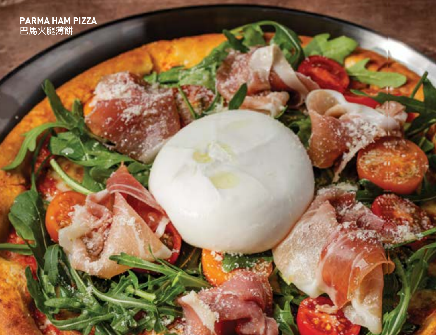
PARMA HAM PIZZA 巴馬火腿薄餅