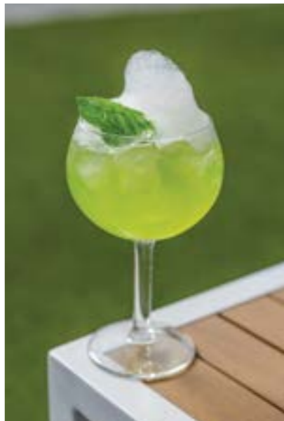
BASIL MELON SPRITZ