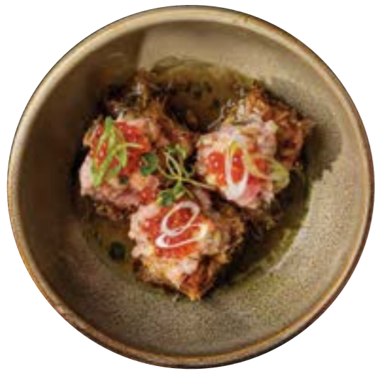
TUNA & SMOKED SALMON WITH DEEP FRIED TOFU

LOADED NACHOS 108 Bolognese, parmesan cheese, peri peri sauce 芝士肉醬焗墨西哥脆片