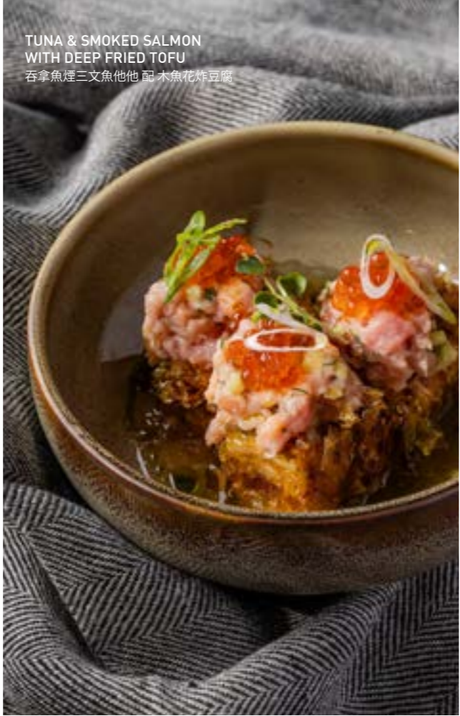
TUNA & SMOKED SALMON WITH DEEP FRIED TOFU 吞拿魚煙三文魚他他配木魚花炸豆腐