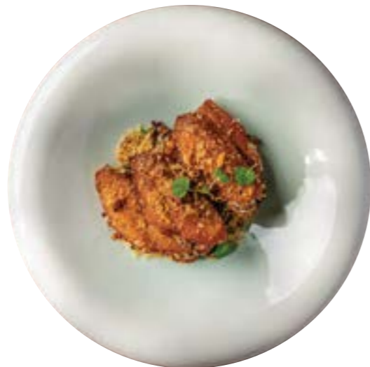
SICHUAN SPICY CHICKEN WINGS