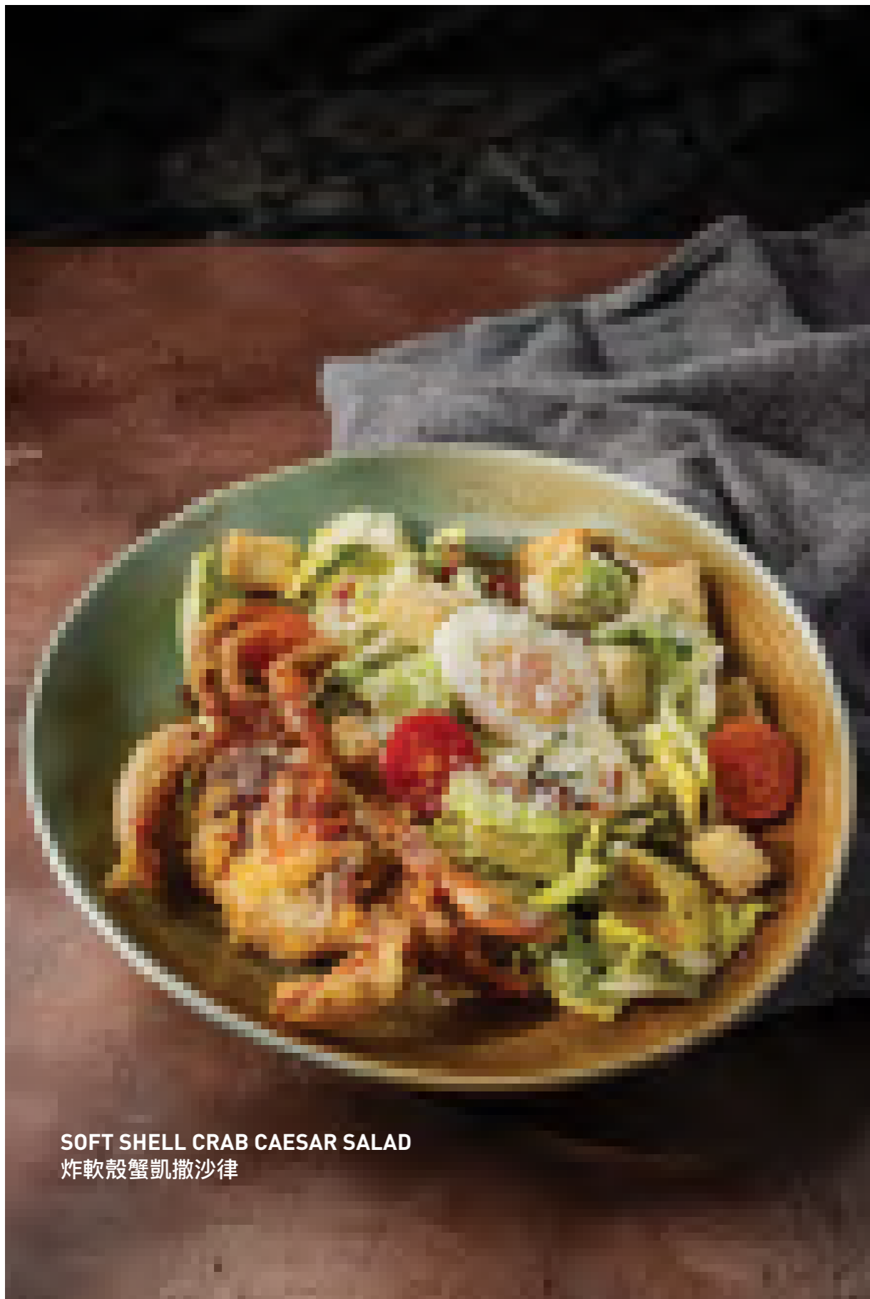
SOFT SHELL CRAB CAESAR SALAD 炸軟殼蟹凱撒沙律