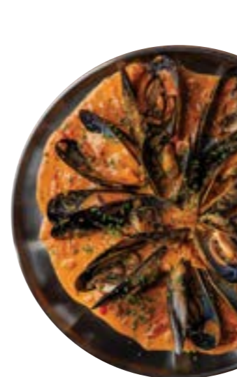
Tomato cream sauce

FRESH MUSSELS (500g) 218 Green curry sauce or tomato cream sauce or white wine 醬汁煮青口配意式香草包 青咖喱椰汁或蕃茄忌廉汁或香草白酒汁